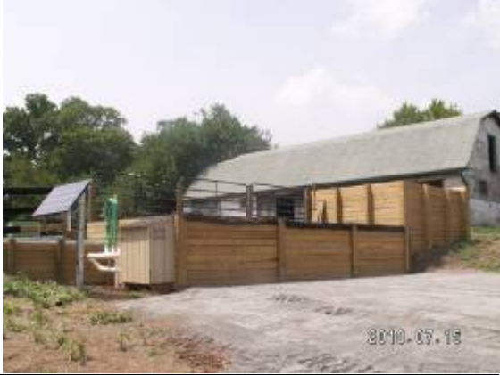
The finished solar powered O2 Composter w/automatic aeration, CompTex cover, and Stable Grids/ bluestone dust pad

As of August 2010, we have just finished the first 30 days of aeration using the O2 composter and should have a finished compost product in another 60 days. Watch for updates or email for more information katenorris@pwsxcd.org .