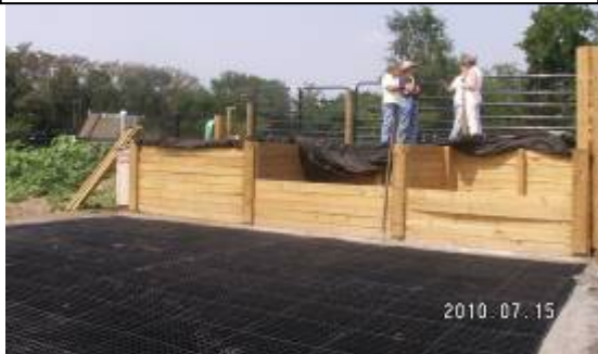
The drop boards that form one wall of the composters are removable

removing the drop boards. These boards slide in and out of grooves on the front of the bin. The area adjacent to the drop boards has been surfaced using Stable Grids . The Stable Grids were placed on the smooth surface that was graded with about 3 percent slope to drain rainfall toward the hayfield. The grids were backfilled with bluestone dust . Our original plan was to backfill the grids with soil and plant grass in the area but we over-excavated the site and had to use bluestone dust to raise the surface area so it would be flush with the edge of