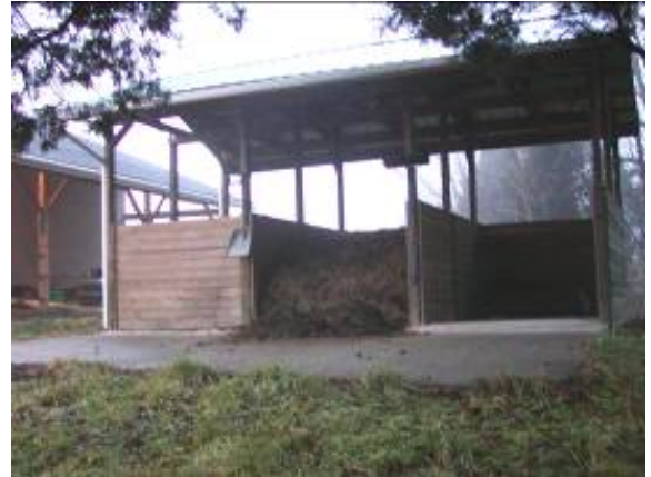
Standard government design w/manual aeration, full roof, and concrete pad