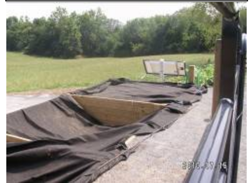
Experimenting with ComposTex fabric

Finished compost will be removed from the downhill side by