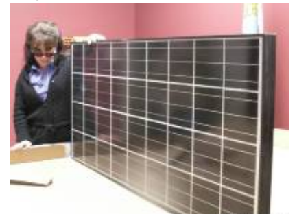
Solar panel for composter

The blower on our system uses solar power. The solar powered unit was developed based on our request and is one of the first solar powered O2 in the U.S.—we heard another solar powered O2 composter is being installed for the White House gardens.