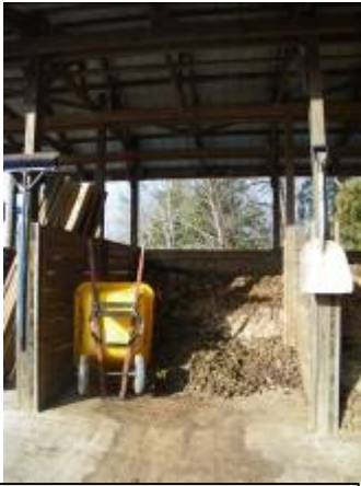
Shovel or tractor required to fill bin

I have a composte built to the Natural Resources Conservation Service specifications. The bins are 5' tall (and no built-in aeration). When I dump my wheelbarrow each day in the bin, the manure builds up in multiple piles only about a foot tall. Every week or so, I have to manually shovel the waste up and back into the bin to fill the bin space. My bins are 5' tall and I'm almost that tall—you can imagine that this is very labor intensive and not my favorite chore.