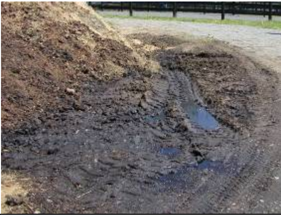
Rainwater can carry pollutants into groundwater

Location, location, location—it's important, even for a manure composters.