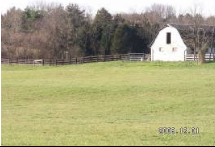
View of composte site from hayfield