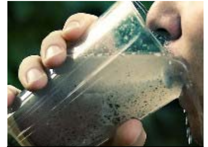
Clean drinking water is important to everyone

should be utilized by grasses. If your pasture is thin, unhealthy, compacted, and/or overgrazed the manure will likely runoff in rainstorms—this is one of the environmental issues. Another environmental issue is the potential of groundwater contamination from rainwater washing through your large manure storage pile. Some soils drain more quickly than others. You know this if you've ever made mud pies or spent time at the beach. When water moves very quickly through a particular soil type the soil is said to be highly leachable. If you have a highly leachable soil type on your property anything applied to the surface, including manure, fertilizers, and pesticides, have the potential of being carried through rainwater, into the soil, and into the groundwater. This is particularly bad news, if you or your neighbor drinks well water.