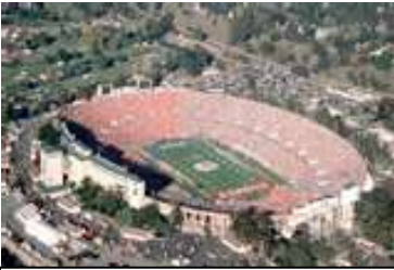
Rose Bowl Stadium

Most horse farms aren't collecting all the manure produced on the farm. Manure will be collected from stalls and should be collected from any dry lots or sacrifice area paddocks. A small-acreage horse farm with about 1 acre of grass per horse will collect about 60% of the manure produced or about 5 tons per year. The manure deposited in a well managed pasture