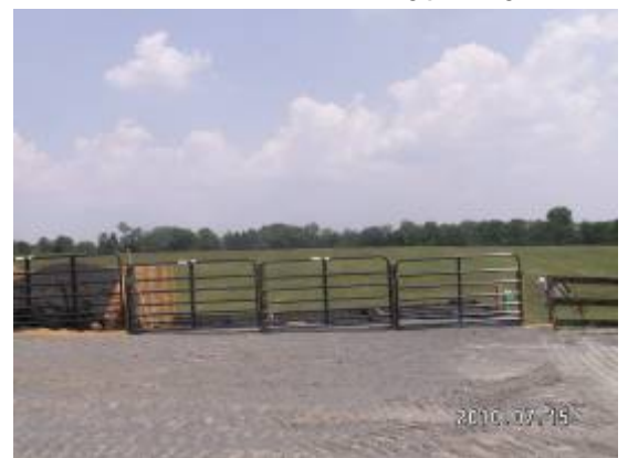
Composte in fence line – paddock in foreground and hayfield in background

The location of the hayfield was another factor in the placement of the composte. You should consider accessibility to the finished compost product. Will you use your compost on your pasture, or will you have it hauled away, or give it or sell it to gardeners? Depending upon your end-user, you may want to locate your compost next to the driveway for easy vehicle access. If Edith produces more compost than she can, or wants, to utilize, the farmer that grows her hay may use it on the adjacent hayfield.