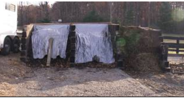
Simple 3-bin system

waste will “heap” compost over time without any management