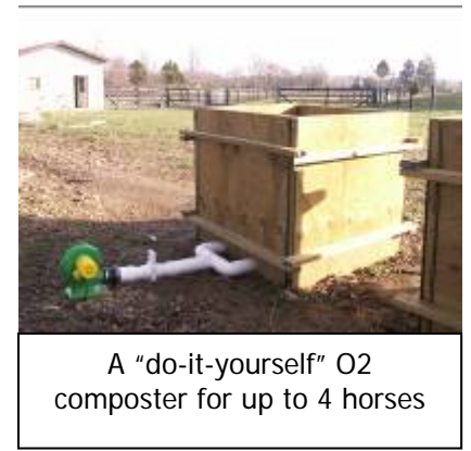
A “do-it-yourself” O2 composter for up to 4 horses

We decided to utilize a design and innovative technology from a company called O2 Compost . Their designs include a blower system to aerate the stall waste without the need to manually turn the pile. Designs range from affordable “do-it-yourself” systems for up to four horses to much more expensive systems designed for larger boarding or breeding operations. Curtis Crawford of Crawford Fencing installed our composter.