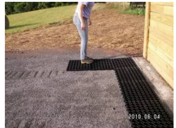
Snapping together the Stable Grids

or high traffic sites like gates, water troughs, travel lanes and even for surfacing smaller sacrifice area paddocks. So far, we've found them to be easy to use.