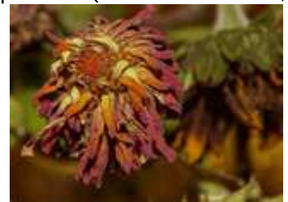
Pesticide residuals in horse manure can kill plants

manure. The manure is then “contaminated” with the pesticide residual. The manure or