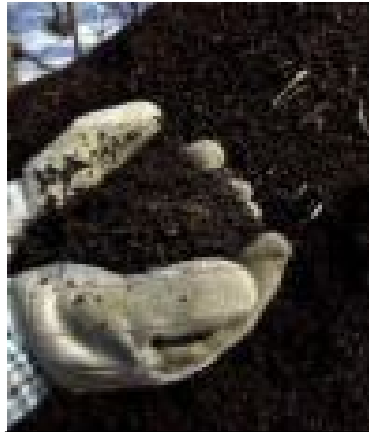
Finished compost...coming soon!