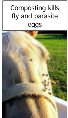
Composting kills fly and parasite eggs

In contrast, if you “actively” manage your waste, you can expect to have compost in a little as 3 months. Active management includes keeping the waste as moist as a rung out sponge and periodically turning, stirring, or fluffing the waste with the bucket on your tractor or a shovel to aerate it. Actively managed compost will reach a temperature of at least 140 degrees which has the added benefit of killing weed seeds and fly/parasite eggs.