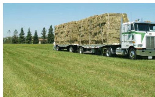
How much do you know about your hay?

*IMPORTANT NOTE – Some of the most horse-friendly pesticides used for weed control have a residual that travels through the horses’ digestive system (w/o harming them) and is passed out in the