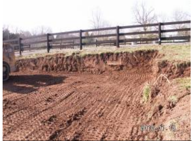
Grading the site for our "top-down" composte

I have a composte built to the Natural Resources Conservation Service specifications. The bins are 5' tall (and no built-in aeration). When I dump my wheelbarrow each day in the bin, the manure builds up in multiple piles only about a foot tall. Every week or so, I have to manually shovel the waste up and back into the bin to fill the bin space. My bins are 5' tall and I'm almost that tall—you can imagine that this is very labor intensive and not my favorite chore.