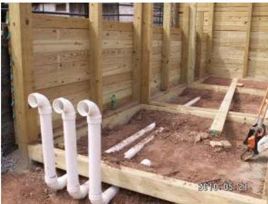
Installing the PVC pipes for the blower in our system

The composter is built with pressure treated wood. You may also consider the use of cinder blocks or even wood/plastic composite materials that are used for decks. Different materials affect the cost and longevity of the composter. Untreated wood will probably “compost” or rot along with your stall waste fairly quickly so cost of replacement should be considered.