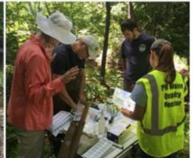
Monitoring at Powells Creek ( PWC Master Naturalist Group)