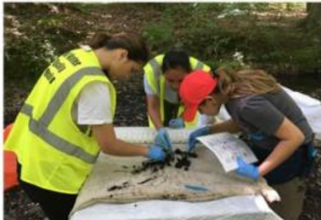
Monitoring at Hooes Run- Occoquan