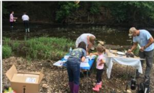
Monitoring at Broad Run Newly adopted monitoring site