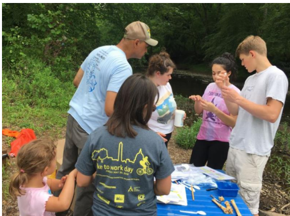
Broad Run New Monitoring Site

The water cycle directly or indirectly affects human health and therefore the need for everyone to join in protecting and conserving this natural resource for the coming generations.