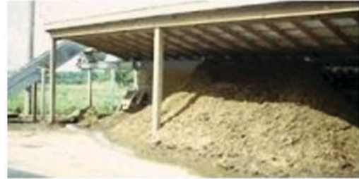
Figure 2. Types of manure storages (clockwise from top left): aboveground steel tank for liquid or semiliquid manure, aboveground concrete tank for liquid or semiliquid manure, earthen pond for liquid or semisolid manure, and stack shed for solid manure.