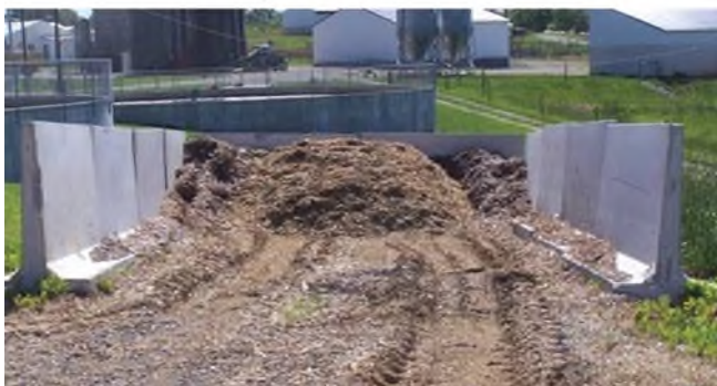
Figure 2. Bunker-type storage structure