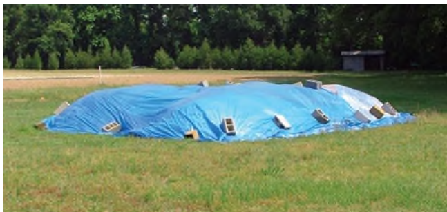
Figure 1. Short-term storage: covered stockpiles

If the litter is to be temporarily stockpiled, it should be covered with plastic sheeting (6 mil minimum thickness) held in place with weights, such as old tires or cinder blocks, with the edges of the sheeting buried, or by other anchoring systems (figure 1). If this practice will be used often, a reinforced, ultraviolet-resistant cover will last longer and may be a good investment.