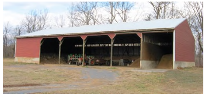
Figure 3. Permanently roofed storage structure

will be used. High roofs will require wall panels and/or a long overhang to protect the stored litter from excessive blowing rain and snow.