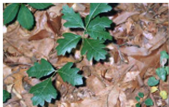
Poison Oak Leaf