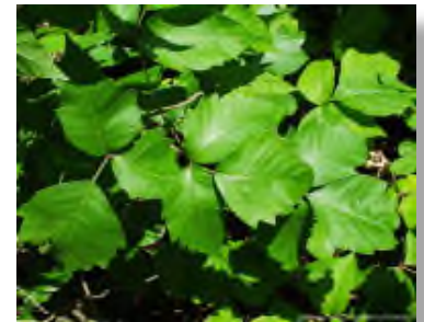
Poison Ivy

poison ivy. The leaflets grow in clusters of three. Hence the old saying “leaves of three, let it be.” These leaflets are from two to four inches long with pointed tips. The middle leaflet is usually larger than the others. The edges of the leaflets don’t always look the same. They might be smooth, or they could have teeth. The leaflet surface can be many different shades of green and appear glossy, dull, or in between.