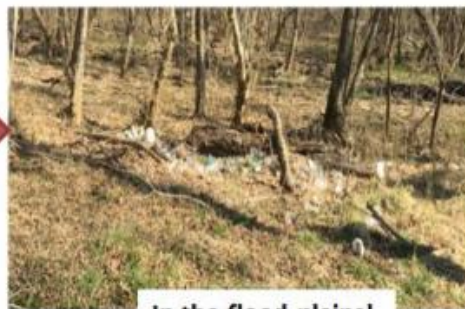
In the flood plains!