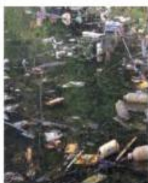
In ponds & streams!

Where does all the trash and litter end up?