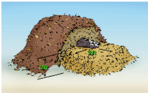
Figure 1: Composting Pile Construction Drawings by Bill Davis, Courtesy of Cornell Waste Management Institute

Composting is a controlled biological decomposition process that converts organic matter to a stable, humus-like product. The microorganisms that break down organic matter are naturally occurring (no special microbes need to be added to the pile). The combination of microbial activity and heat generated during the composting process destroy pathogens. Please note that many farmers think that composting involves placing the mortality in a hole with woodchips or other organic matter. This is not the case. As shown in Figure 1, composting occurs above ground.