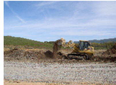
Composting Mortality at the Shenandoah County Landfill

Some county landfills accept animal mortality from farms in their locality. Landfills will either bury or compost the animal mortality. Availability, price and drop-off times will vary by county, so contact your local landfill or Extension Office for more information.